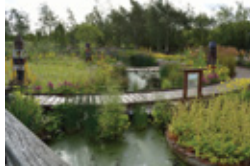
RBC Rain Garden

Headley Discovery Hide – visit this beginner bird watcher hide in World Wetlands to use the binoculars, bird ID books and pick up tips on watching wildlife.