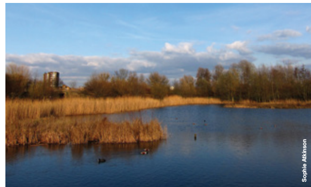
Wetland Centre view

Peacock Tower – visit our three storey hide for panoramic views across the reserve.