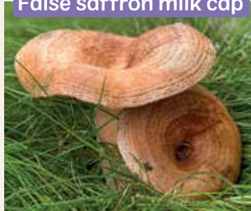
False saffron milk cap